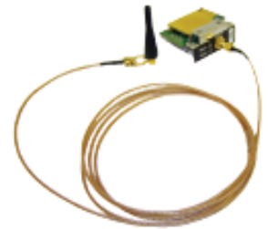
Modem Option Card with 2 meter extension cable