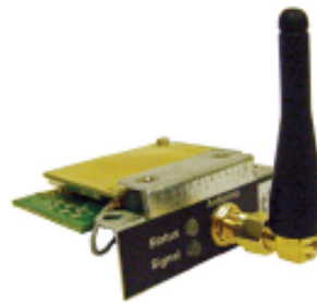
Modem Option Card with Antenna